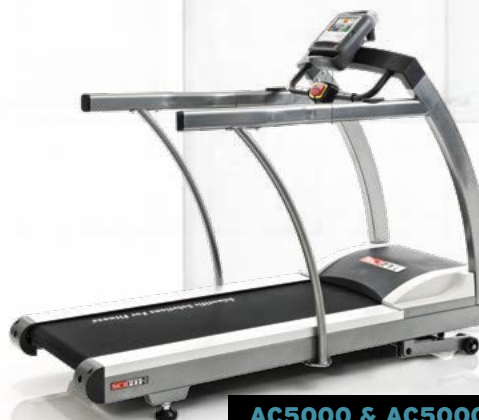
AC5000 & AC5000M Medical