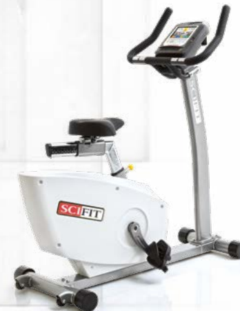
ISO1000 & ISO7000 Medical