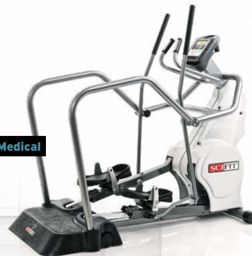
SXT7000e 2 Medical