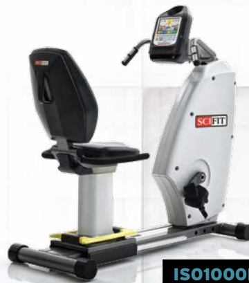
ISO1000R & ISO7000R Medical